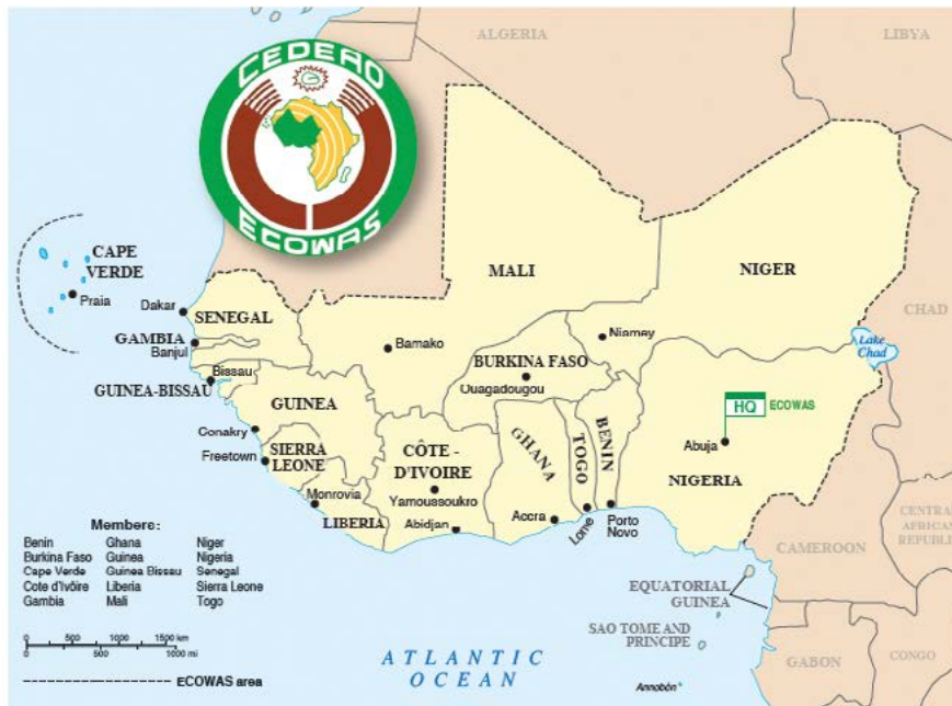
Figure 4. Map of State Members of the ECOWAS.

The archipelago strategic value should comply with political variabilities and economic dynamics. Further, it is also possible to realize that the whole discursive analysis around specific island characteristics of Cape Verde is a mere appropriation of history. Both geopolitical dynamics and historical conjunctures condition and activate “the valences that, in a particular time, make a particular place or space be more or less conducive to the coordination of boards and relational flows with other spaces” (Tavares, 2016, p. 13). The author presents a more detailed and in-depth analysis, considering that the archipelago currently has “a great strategic value to the transnational criminal networks, which have proliferated with regard