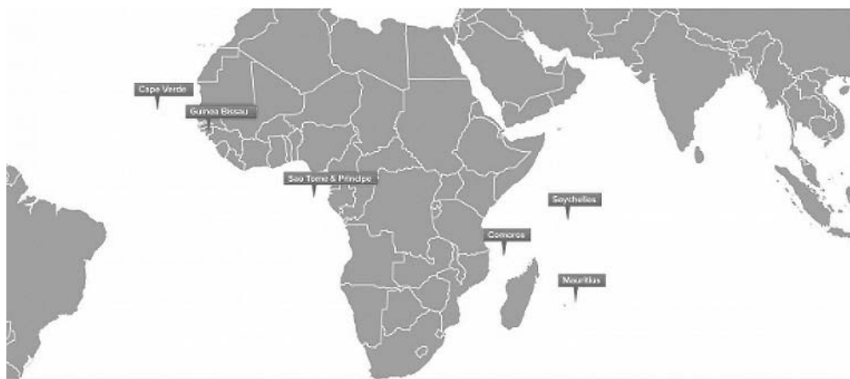
Figure 2. Geographic Location of African SIDS.

In the last decade, the United Nations Office on Drugs and Crime (UNODC) official data indicates that large amounts of cocaine are stored in West African countries. Its origin is mainly South America and is carried to Western Africa by sea. Three main routes are used, namely, the Northern route, from the Caribbean via the Azores to Portugal and Spain; the South America Central route via Cape Verde or Madeira and the Canary Islands to Europe; and more recently, the South America African route to West Africa and, then, to Spain and Portugal (UNODC, 2018a; 2018b) (Figure 3).